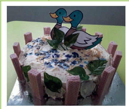
Happy 25th Birthday Fisherfield Childcare.

The children had lots of fun celebrating our birthday in May. We baked a special celebration cake, created lots of junk modelling silver robots and had a fun packed party day.