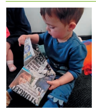
Eid We celebrated Eid with a party, pass the parcel game and we enjoyed a traditional food