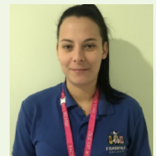
Welcome back to Ainsley